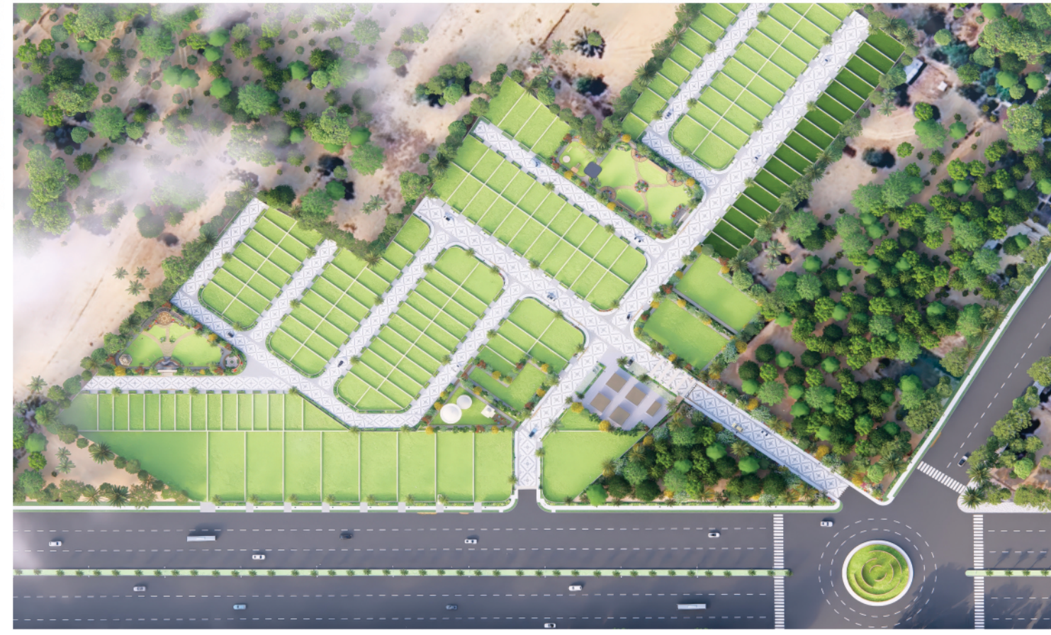
Park Areal View