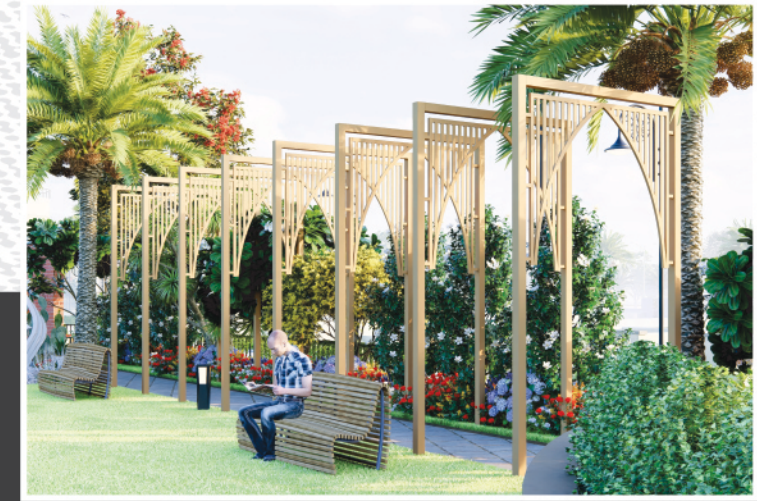
Park Entry Arch