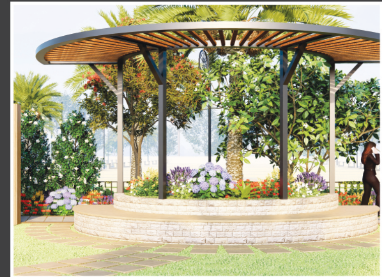
Gazebo / Pergola