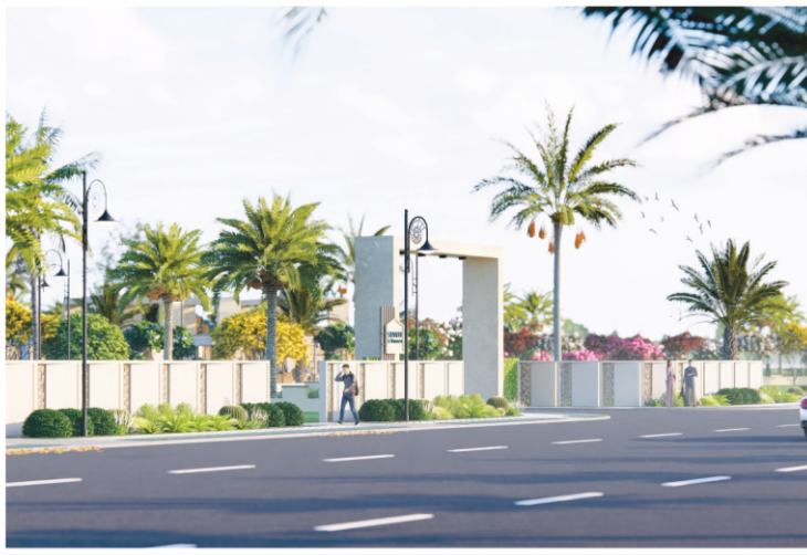
Park Wide Entry