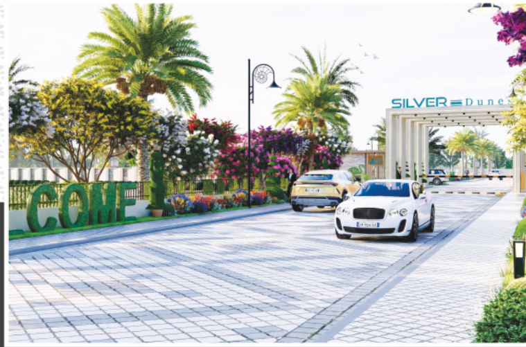
Internal Tiles Block Road