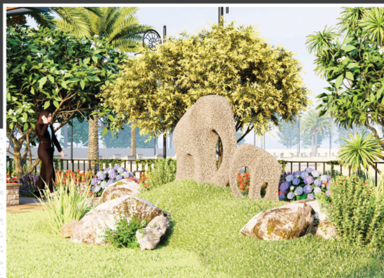
Park with Dune