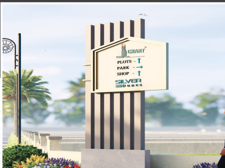
Street / Plot Demarcation