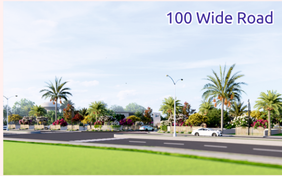
100 Wide Road