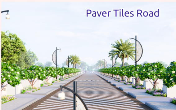
Paver Tiles Road