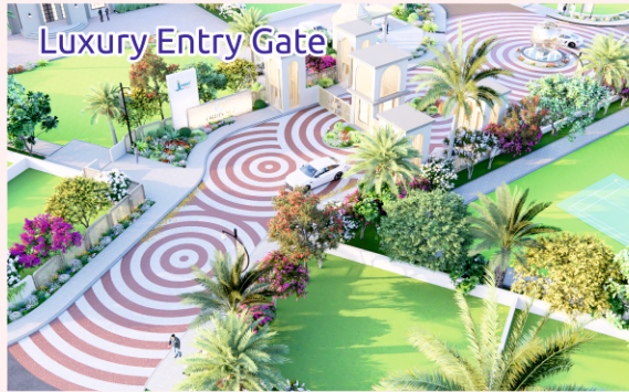
Luxury Entry Gate